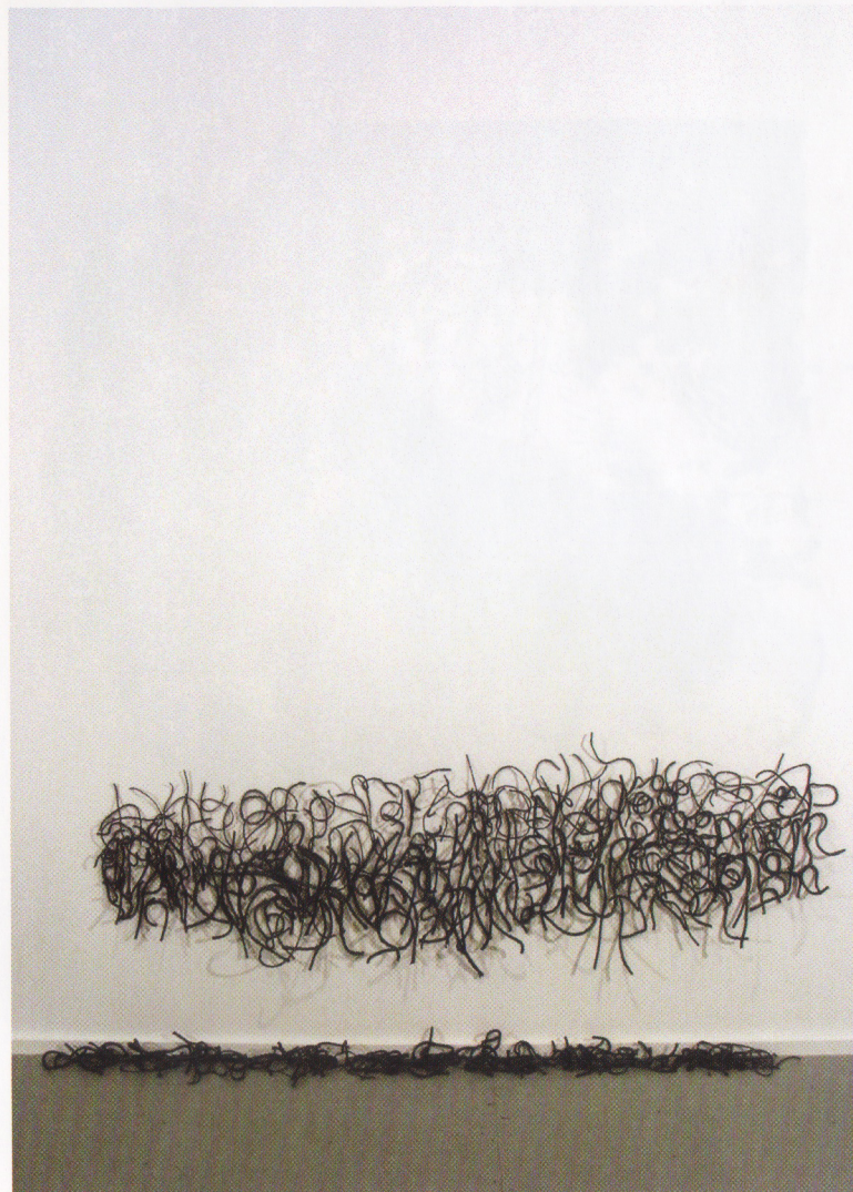
SQUIGGLE, Paper, Graphite & Cotton Rope, 2005, Dimensions Vary